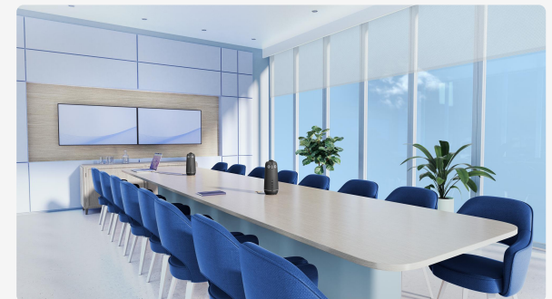
MEETING OWL 4+ and MEETING OWL 4+