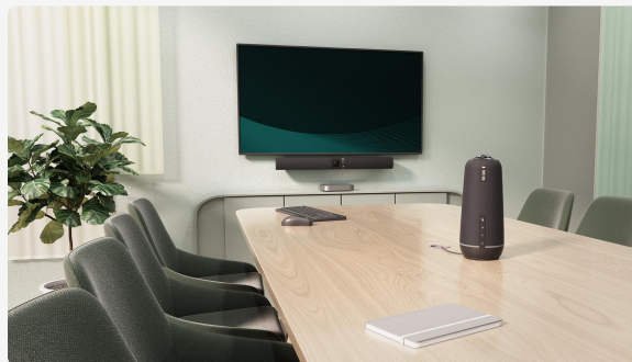
MEETING OWL 4+ and OWL BAR

The Meeting Owl can stand on its own to support smaller huddle spaces or be paired with the Owl Bar or a second Meeting Owl for collaboration in larger spaces.