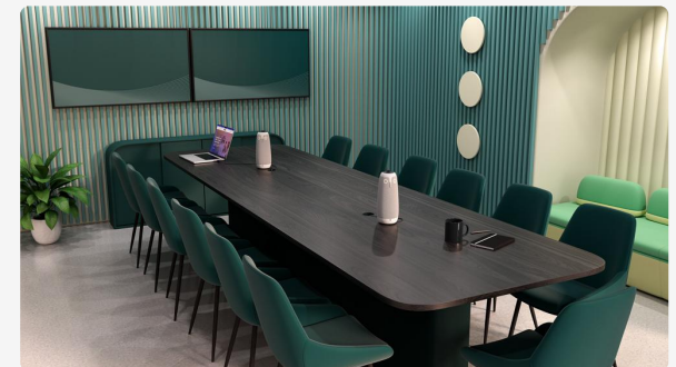
MEETING OWL 3 + MEETING OWL 3