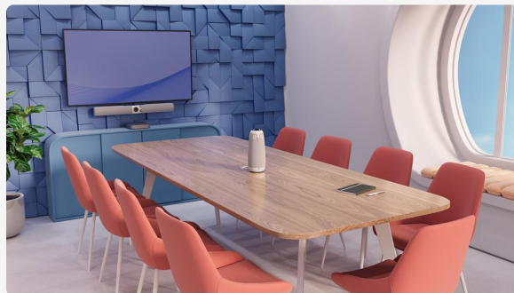
MEETING OWL 3 + OWL BAR

Wirelessly pair with the Owl Bar or a second Meeting Owl for collaboration in larger spaces