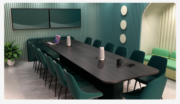
MEETING OWL 3 + MEETING OWL 3